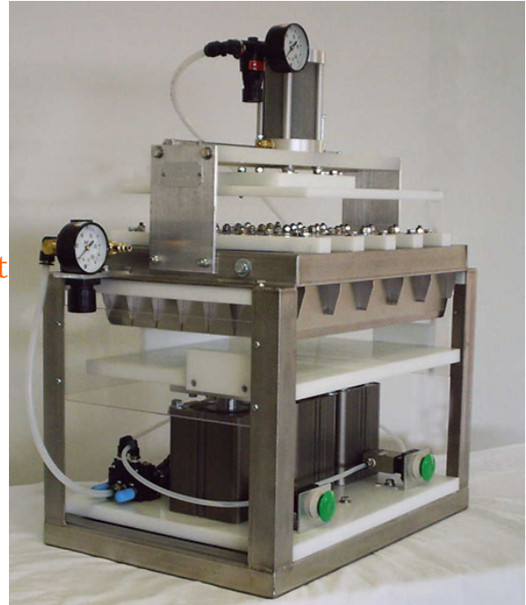
Above shown with optional Power Stripper