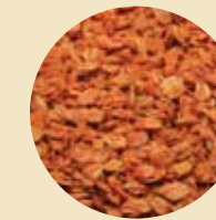
Raspberry Flavored Coated Oat Topping