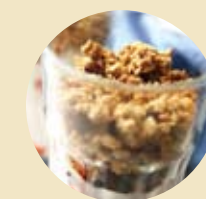
Whole Grain Cluster Yogurt Topping