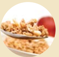
Whole Grain Cluster Cereal