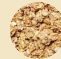
Granola Oat Clusters with Whole Grain Oats