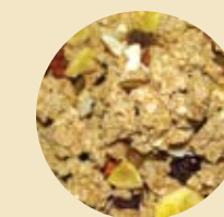
Banana Nut Granola Trail Mix with Whole Grain Coated Oats