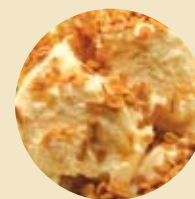
Coated Oat Ice Cream Topping