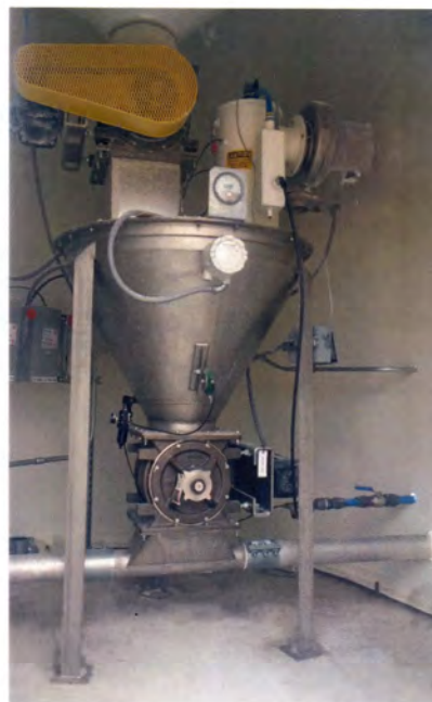
PNEUMATIC CONVEYING SYSTEM

VISIT WWW.CAMCORPINC.COM AND VIEW A VARIETY OF FOOD PROCESSING SYSTEMS DESIGNED BY CAMCORP.