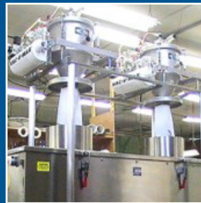
Automatic Refill of Depositors