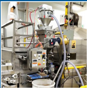
Automatic Refill for Topping Machines