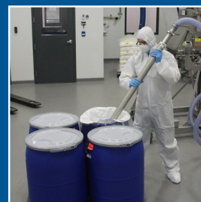
Transfer of Ingredients from Various Sources