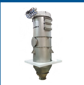
Sanitary Filter Receivers for up to 25,000 lbs/hr