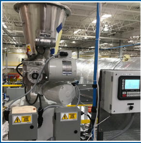
Volumetric/Gravimetric Feeder Refill