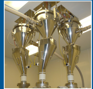
Conveying Ingredients to Food Extruders