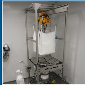
Bulk Bag Loading & Unloading Systems