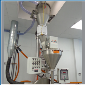
Conveying Powders & Granules to Packaging