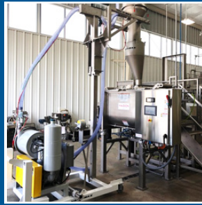
Mobile Conveying for Mixer Loading