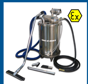
Combustible Dust Vacuum Cleaners

Concerned about combustible dust? Learn more about VAC-U-MAX's full line of Portable, Continuous-Duty, and Central Vacuum Cleaning Systems!!