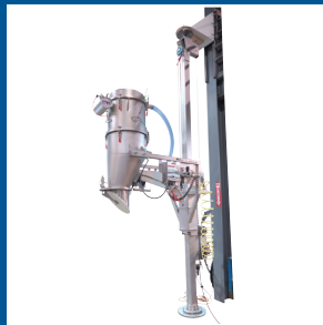
ColumnLift™ for Elevated Mixer Loading