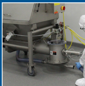
Screw Dischargers for Optimal Material Flow