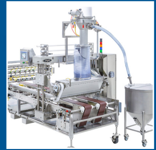
Auto-Refilling Food Ingredients