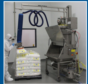
Sanitary Bag Dump Station w/ LoadLifter™