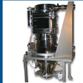
Batch Weighing Multiple Ingredients