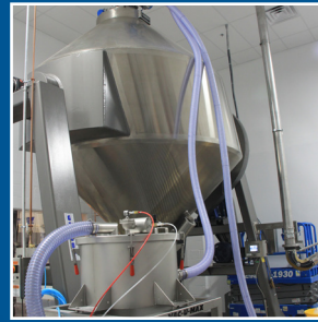
Direct Charge Loading to Mixers & Blenders